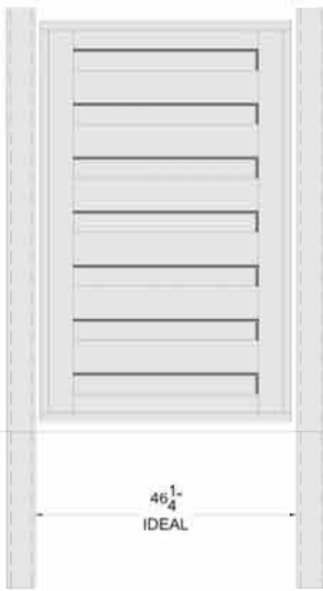
SINGLE GATE OPENING

LATCH GAP IDEAL: \frac{7}{8} " MIN: \frac{1}{2} " MAX: 1\frac{1}{2} "